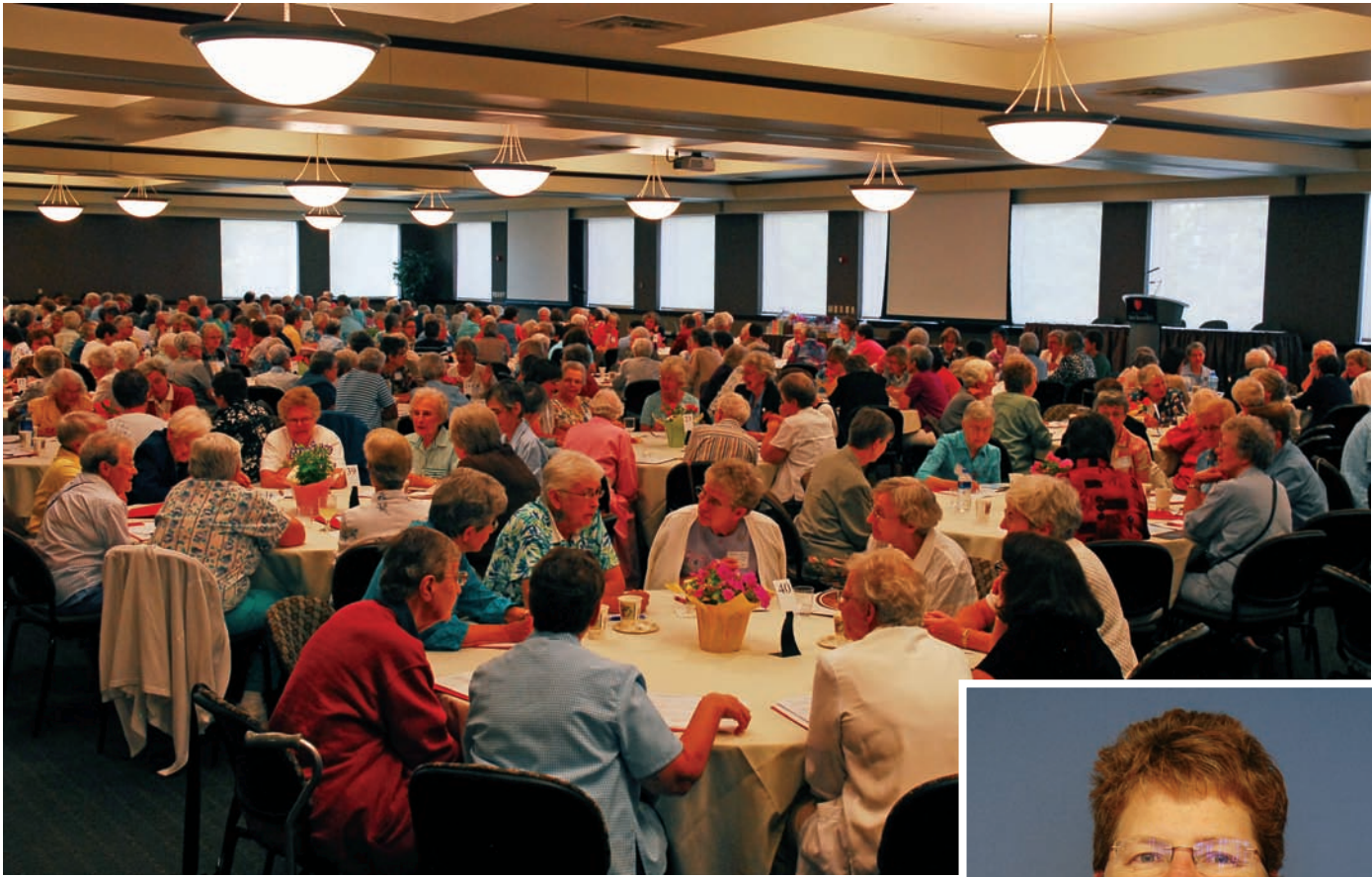
Nearly 400 sisters attended the LCWR conference.