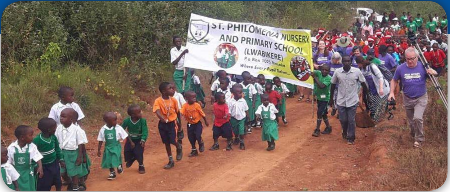
The children marched through the village in celebration of the new school and church.